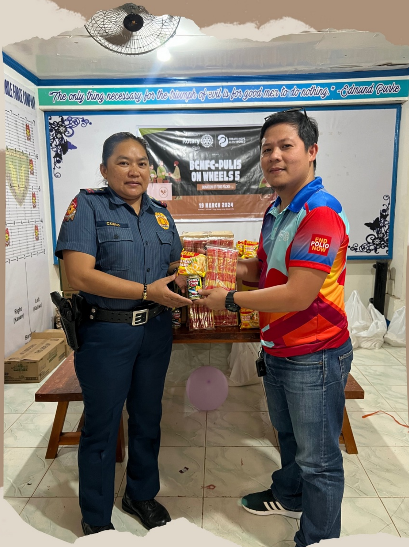
Donation of Food Packs for Baryg. Nongnong